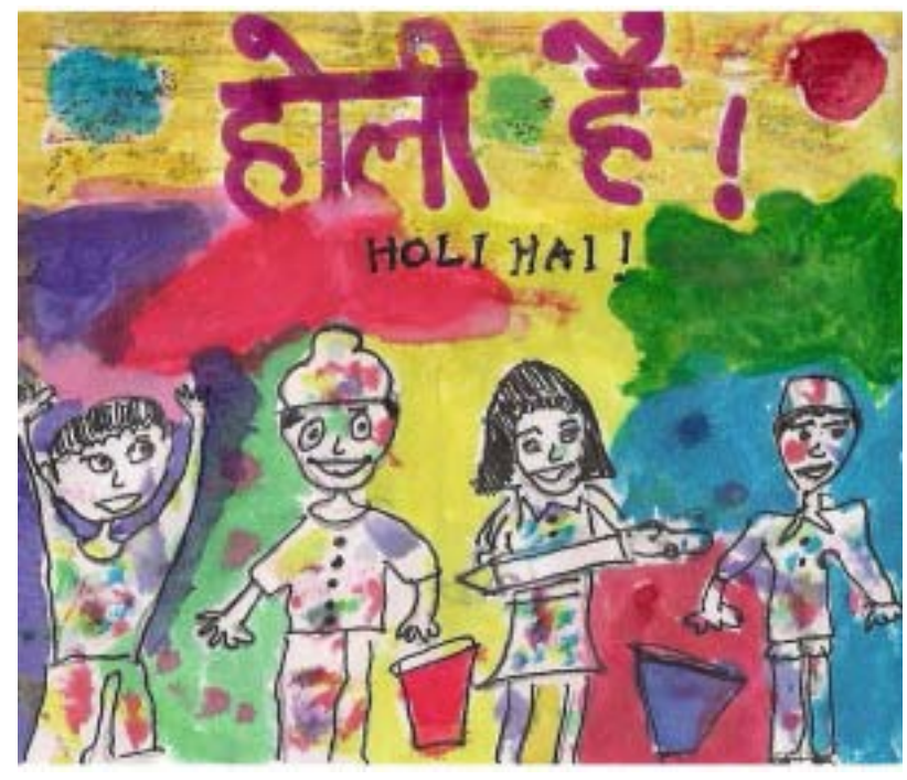
Next month Patrika cover can be your kids painting details on page 9