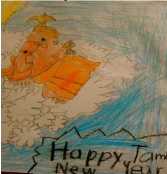
Winner : CHINMAY KRISHNA 6 year old

Next month Patrika cover can be your kids painting details on page 21