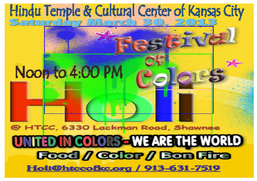
"PLAY THE COLORS WITH JOY - SHARE LOVE AND HAPPINESS"

Holi is the festival of color and joy. It is the day celebrated by all faiths and religion. The colors of Holi also bring along with themselves the spirit of joy, naughtiness, passion and enthusiasm. This festival is celebrated by people throwing colored water at each other. The festival in itself is the celebrations of the divine love of Radha and Krishna as well as the commemoration of the fact that "Goodness always triumphs over evil".